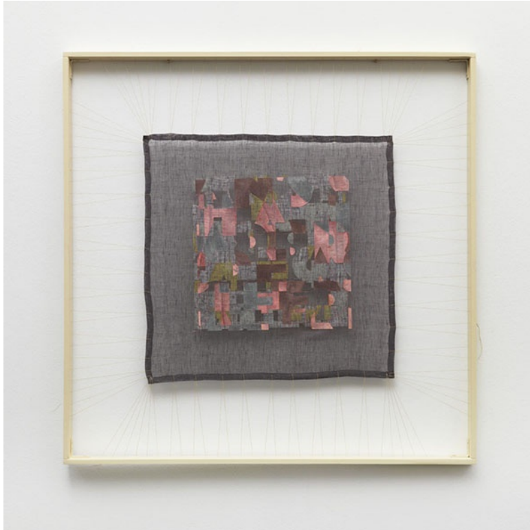
Pae White, "Special No. 127", installation views at neugerriemschneider, Berlin, 2014

© Galerie neugerriemschneider, Berlin. Courtesy: the artist and neugerriemschneider, Berlin. Photos: Jens Ziehe, Berlin.